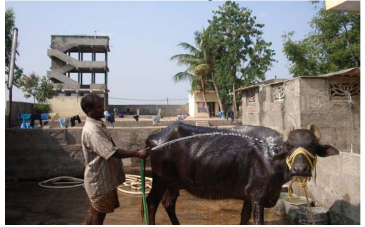
Daisy gets a bath. Completed water-tower in the background.

The handsome creature is to be called Daisy and joins Ruby, Goldie, and Brownie, all formerly given to us by supporters.