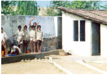
Boys WC block in 2000

Fundraising. The Chairman writes: It seemed to me necessary to ask sympathizers to dig deep so that it would be clear to all concerned that we could and would meet the challenge of supporting 239 children, 30 staff and a school. When you are presented with a seemingly impossible task it is no good moaning. I took the simple view that if God wanted CHIT to succeed, it would. My job was a bit like the man in St Luke's gospel who had to wake up his neighbour to beg some bread for unexpected visitors. Faith and persistence won the day.