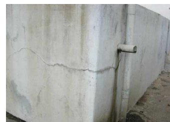
Cracks in the water tank