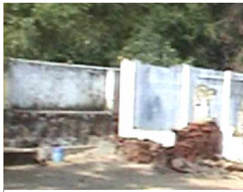
Boys WC block now

Our first report to the Charity Commissioners will show that CHIT is healthy and safe. After 5 months we have 100 supporters. The majority have committed to sponsor. This is invaluable because reliable income is vital. Thank you all. If you are less than happy with your feed-back please tell us. Added to that core we have to express special thanks for a dozen people who have come up with substantial lump sums. One Church needs a special mention: St Johns Kenilworth. To find their new vicar as supportive as his predecessor, our president, was the confirmation I needed that we were in the Lord's will. The support and prayer coming from that church (already heavily committed in other directions) has been hugely uplifting.